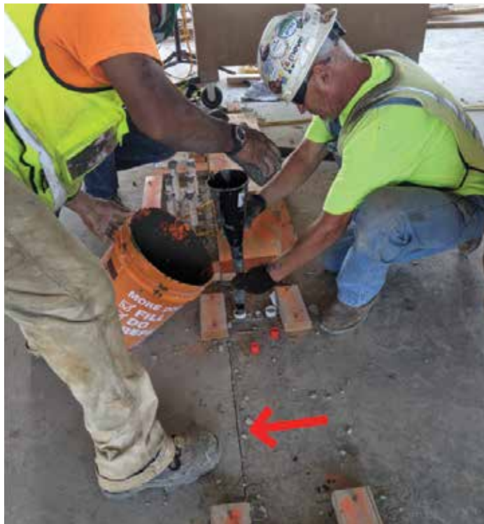
Figure 3. The PS=Ø mechanical coupler allows for a gapless pour strip and is grouted with a high-strength, non-shrink grout after the EOR specified time; the red arrows indicate the open joint that will be filled with the same non-shrink grout.

References are included in the PDF version of the article at STRUCTUREmag.org .