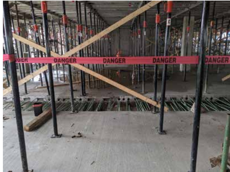
Figure 1. Pour strips minimize restraint and allow for volume change but create scheduling issues and safety concerns. Furthermore, delayed pour-backs have a trickle-down effect for other trades.

Volume change and RTS are challenging aspects of concrete construction and are often misunderstood. They are even more challenging when PT is involved. The issue is the tensile stress created when slab shortening is restrained by stiff structural elements. A properly designed pour strip temporarily interrupts slab continuity between the stiff elements, lowers RTS, and allows for volume change. Since creep and shrinkage strains increase with time, cracking can be reduced by keeping the pour strip open longer. It is common for EORs to require a pour strip to remain open for 28 or 56 days and sometimes even longer for better performance. Serviceability is the primary design concern, and PT slabs are not designed to crack. Excessive cracking leads to deflection, vibration, and corrosion (parking garages) problems, leading to architectural complications.